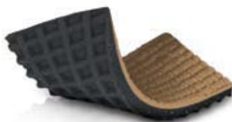
INFIELD / BROWN PX-60