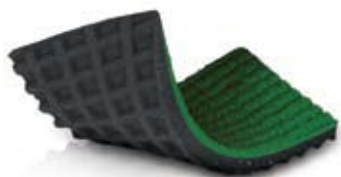
OUTFIELD / FIELD GREEN PX-32