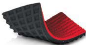
INFIELD / CLAY RED PX-10