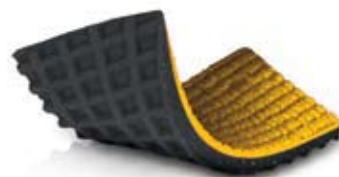
CUSTOM COLORS AVAILABLE